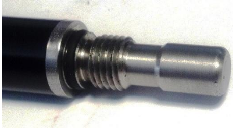
Water Tight and Threadlocking Connection.

Alignment spud prevents cross threading and adds strength to the joint as it is tightly toleranced for the inside of the tubing.